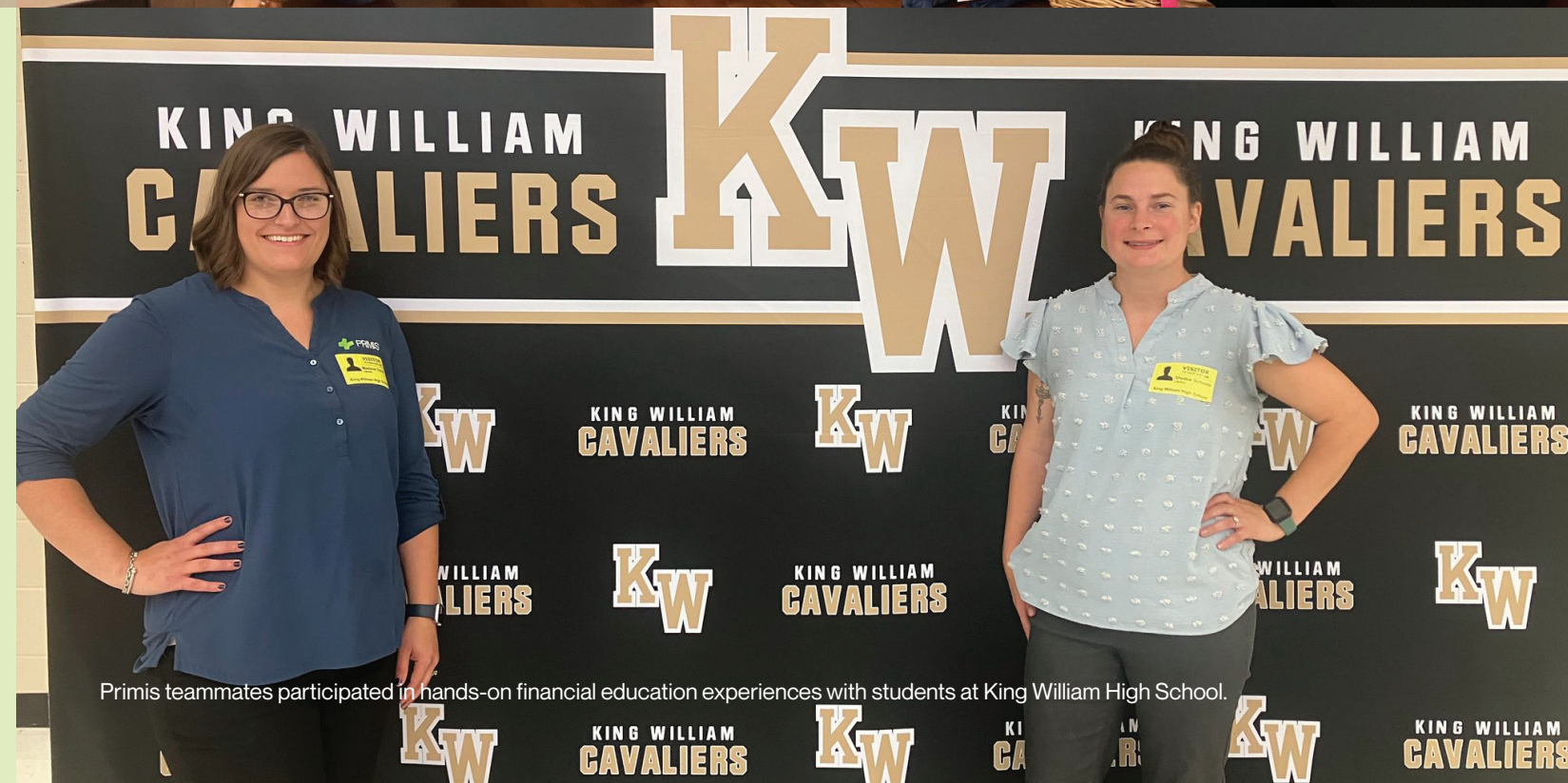
Primis teammates participated in hands-on financial education experiences with students at King William High School.

Practical financial knowledge can create lasting impact across generations.