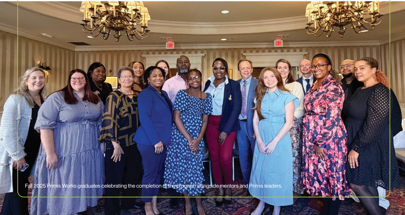
Fall 2025 Primis Works graduates celebrating the completion of the program alongside mentors and Primis leaders.