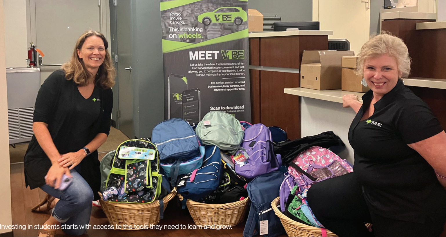
Investing in students starts with access to the tools they need to learn and grow.

Financial confidence starts with access, education and opportunity.